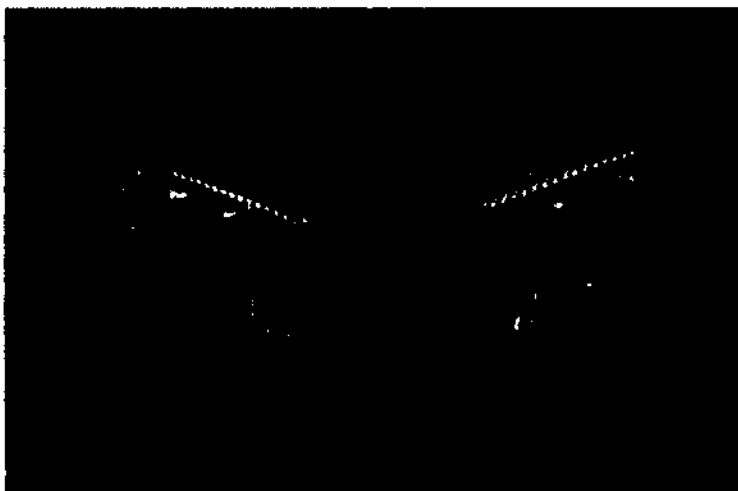
Installed Owl Eyes on GL1800

These instructions are intended to cover two possible situations, first that you bought a complete Owl's Eyes kit, and secondly that you bought an Owl's Eyes kit without the Cee Baileys headlight protectors.